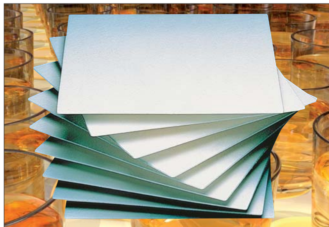
Seitz IR Series Filter Sheets